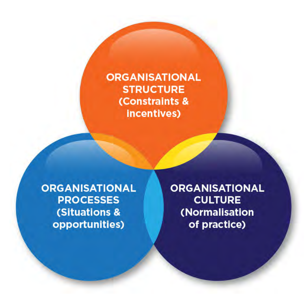
Figure 4: Vectors shaping individuals' decision-making and judgement

Putting these dimensions together, we might think of individual personnel as making decisions and judgments and taking actions within a field shaped by a number of vectors. Figure 4 below demonstrates these vectors.