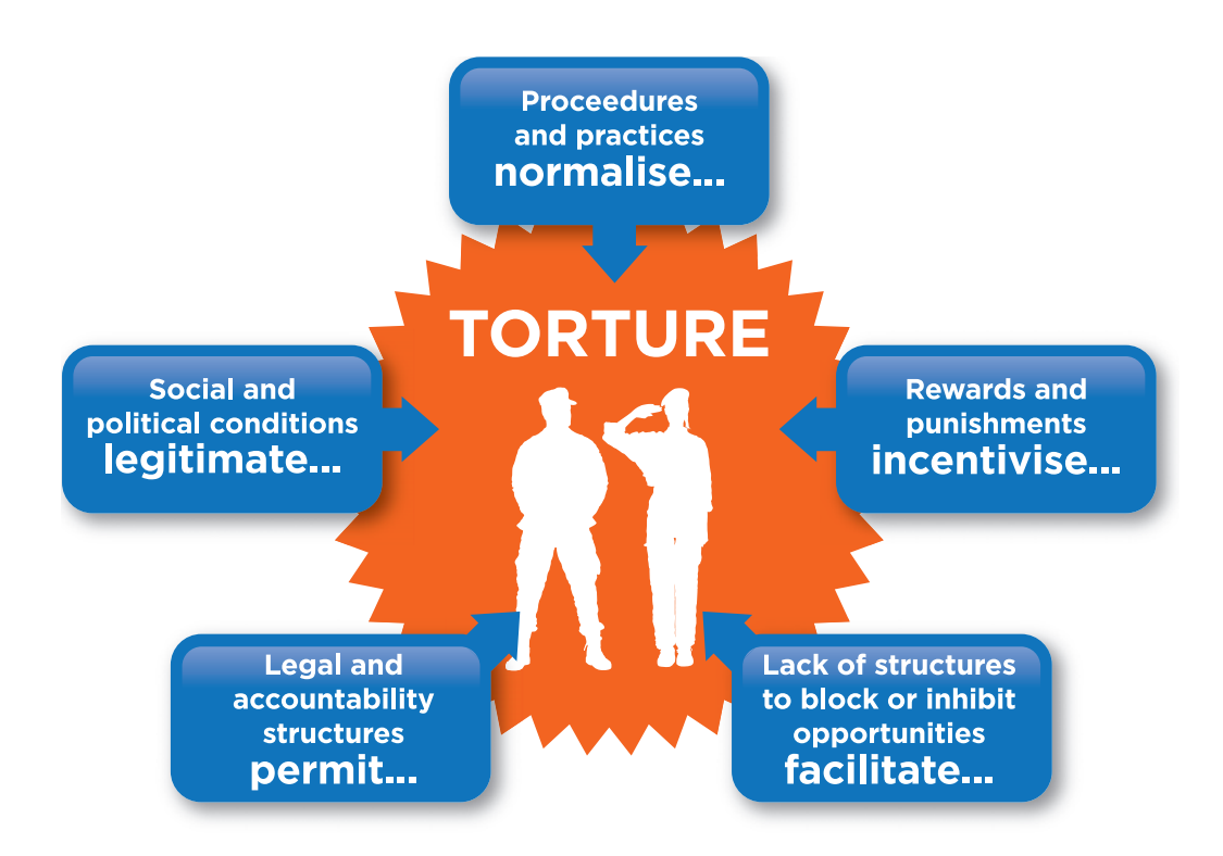
Figure 3: Dimensions of security organisations influencing the use of torture

As Figure 3 illustrates, the different dimensions of security organisations are not completely discrete, but significantly overlap. To take a practical example, rewarding a police person who gets the most confessions creates incentives, but it also normalises such behaviour. Nevertheless, mapping the overall organisational field in this way allows us to get a better handle on the actual mechanisms whereby organisations operate in a way that is conducive to or inhibiting of the use of torture. Below we consider each of the three dimensions in turn.