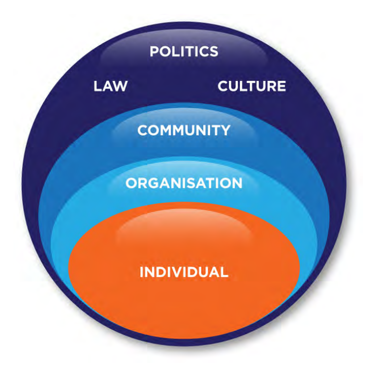
Figure 2: An ecological model for the security forces

Drawing on Brofenbrenner's model, we suggest that the different levels or layers of causality in relation to the use of torture might be mapped thus: