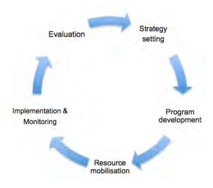
Figure 1: A Program Lifecycle

At the organisational level, a well-conducted evaluation indicates to a project team whether the project achieved the change they set out to produce and, at a more fine-grained level, what worked and what did not. The findings of an evaluation should, ideally, feed back into an organisation's future planning and project development so that each project builds on the lessons learned from the previous ones. Over the past two decades, the field of human rights and development has also seen an explosion of the number of organisations implementing donorfunded projects and programs; from local grass-roots organisations to national, regional and international NGOs, bilateral partnerships between aid-giving governments and developing countries and any combination of the above. One outcome of this expansion has been the creation of a competitive 'market' for organisations to win grants from the existing and shrinking pool of aid and donor funding available. In practical terms, human rights organisations can therefore use evaluations as evidence of their performance or track record in implementing projects, which may assist in winning future grants in this competitive space.